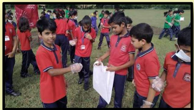
STUDENTS USING CLOTH BAGS FOR COLLECTING THE WASTE