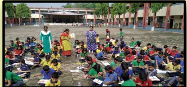
TIME TO DRAW