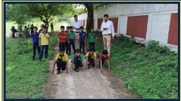
4x10 METER SHUTTLE RUN