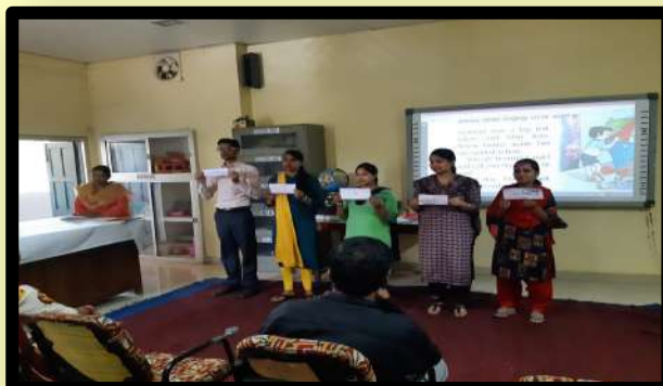
DLM PRESENTATION BY THE TEACHERS