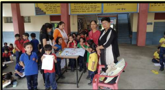
FUN WITH THUMB PAINTING