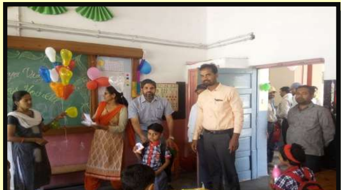
GIFT DISTRIBUTION BY THE PRINCIPAL