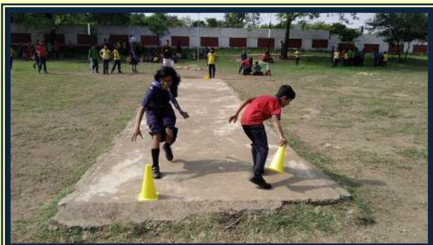
50 METER DASH