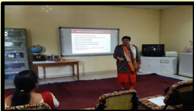
HM TAKING SESSION ON CMP & TEACHERS DAIRY