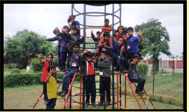
CLASS I STUDENTS VISIT TO SANJIVANI PARK