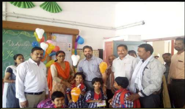
WELCOME BY THE PRINCIPAL & VICE PRINCIPAL

School Readiness Programme is a perfect blend of fun and frolic. It is a 4-6 weeks programme, which helps to develop a familiar environment for the students and paves way to attract students towards learning.