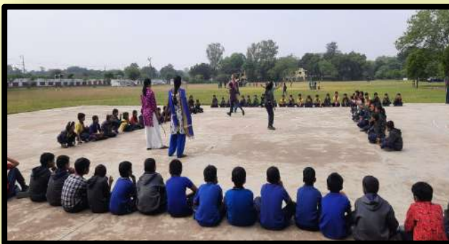
TIME TO PLAY SOME GAME