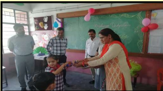
GIFT DISTRIBUTION BY I/C HM