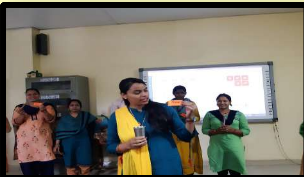
DLM PRESENTATION BY THE TEACHERS