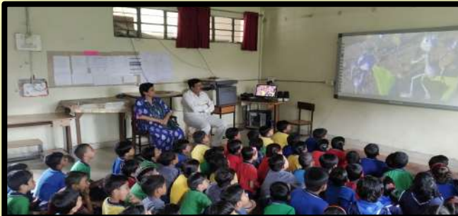
STUDENTS ENJOYING MOVIE SHOW

Every Saturday is being celebrated as Funday (Anandwar) in the Vidyalaya. Different activities like yoga, dance, music, Art & craft, Scientific activities, library sessions, film shows, mental math etc are being organized. Funday provides a platform to bring out the hidden talent of the students.