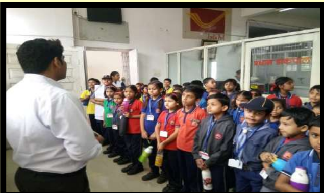
CLASS III STUDENTS VISIT TO POST OFFICE