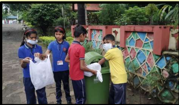
STUDENTS CLEANING THE SCHOOL PREMISES