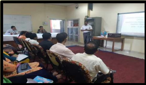
PRINCIPAL ADDRESSING TEACHERS

Training programme on "Strengthening of Primary Education" was conducted for the teachers of Primary Section. Orientation programme for newly recruited PRTs was also conducted on 5th October 19 to make them aware of the functioning of KVS.