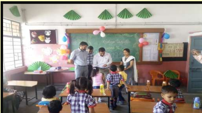
GIFT DISTRIBUTION BY THE VICE PRINCIPAL