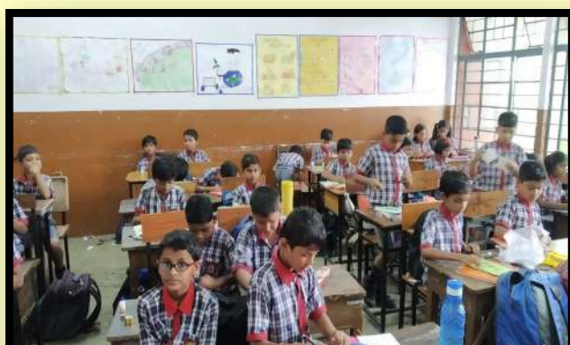
PAPER FOLDING COMPETITION