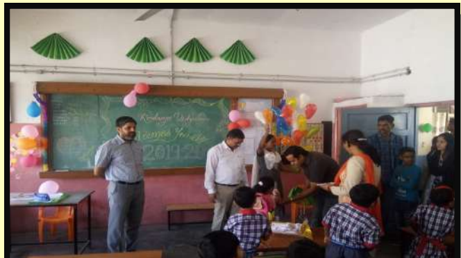
PRESENTATION OF BALLOONS