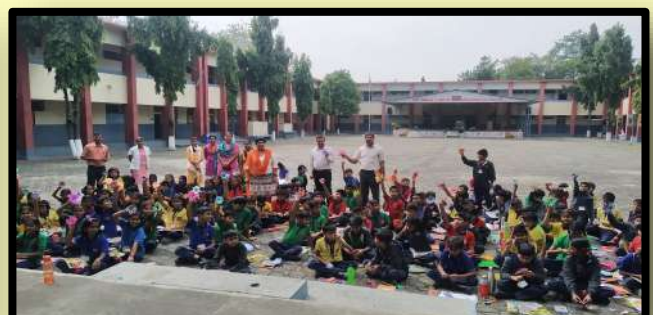
FUN WITH PAPER CRAFT