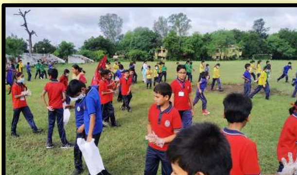
STUDENTS PARTICIPATING IN SWACHTA ABHIYAN