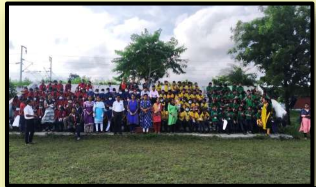
STUDENTS AT FINISH POINT