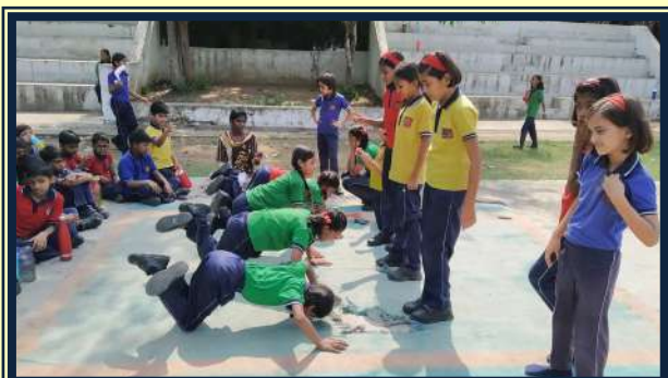
PARTIAL CURL UP