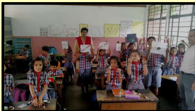
RAKHI MAKING COMPETITION