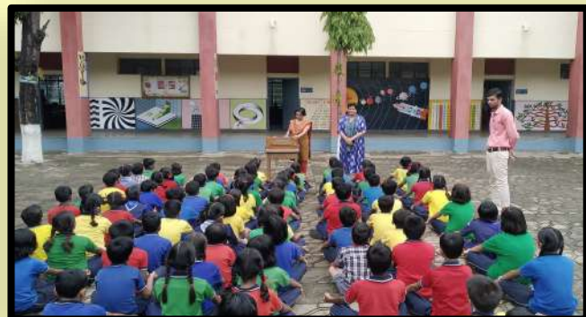
STUDENTS ENJOYING MUSIC SESSION