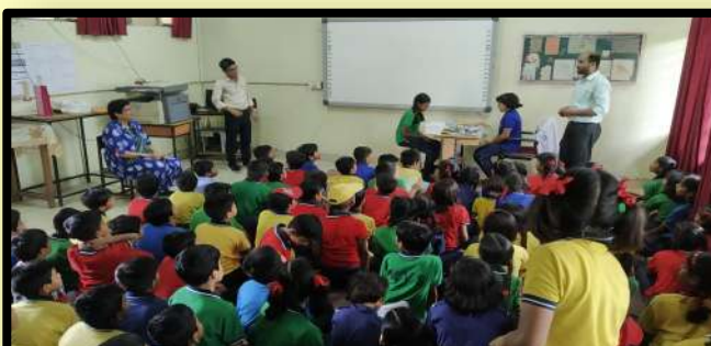
STUDENTS PERFORMING ACTING