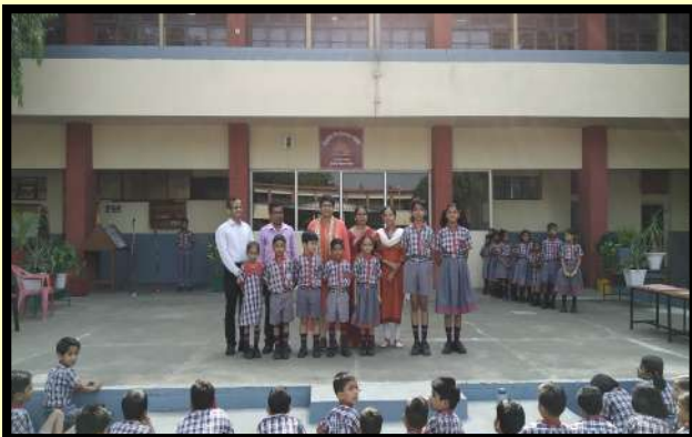
WINNERS OF ENGLISH POEM RECITATION COMPETITION

A Co-curricular activity essentially takes place outside a typical pen and pencil classroom experience. It gives the students an opportunity to develop particular skills and exhibit their non-academic abilities.