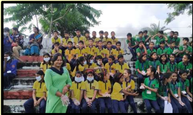
STUDENTS RELAXING AFTER THE RUN