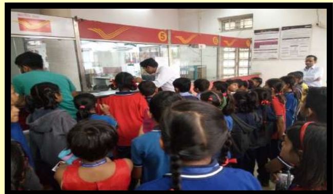
STUDENTS VISIT TO POST OFFICE