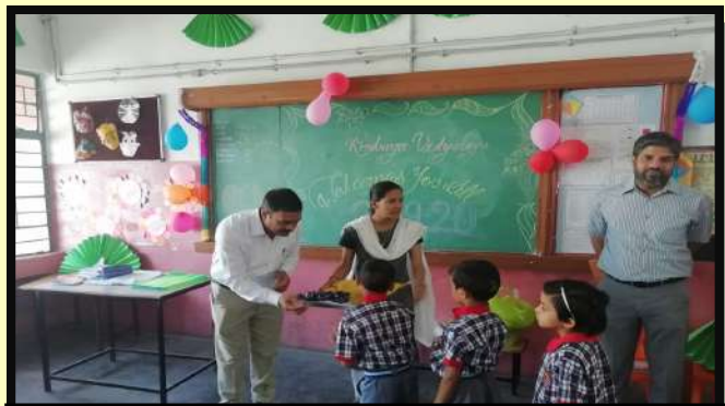
CHOCOLATES DISTRIBUTION BY VICE PRINCIPAL