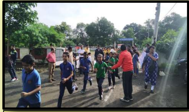
RUN FOR UNITY IN PROGRESS