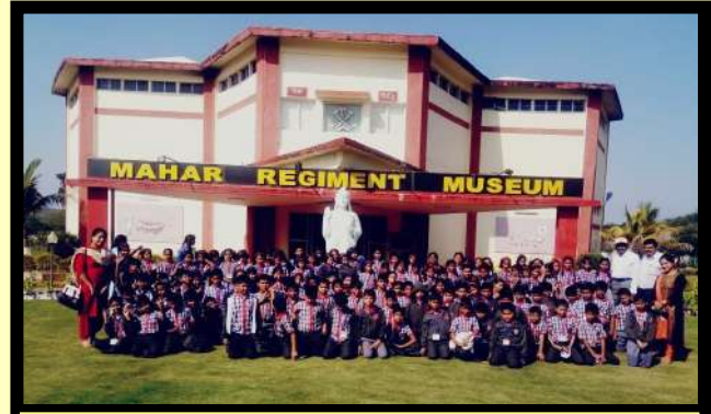
CLASS V STUDENTS VISIT TO MRC MUSEUM