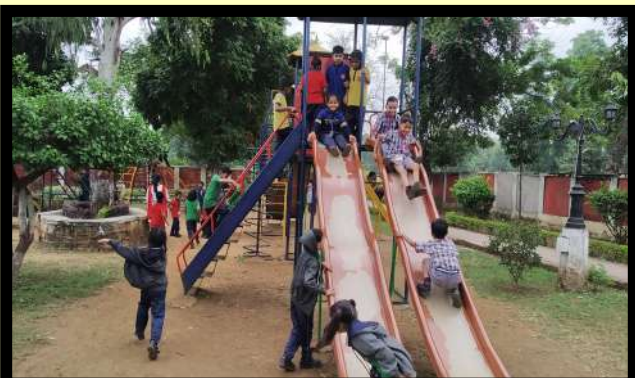
CLASS II STUDENTS VISIT TO JOGGERS PARK