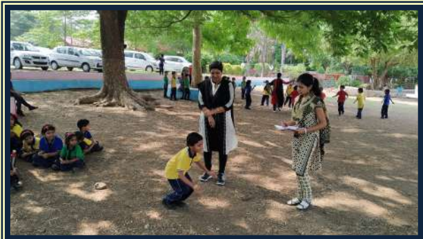
JUMP AND LANDING