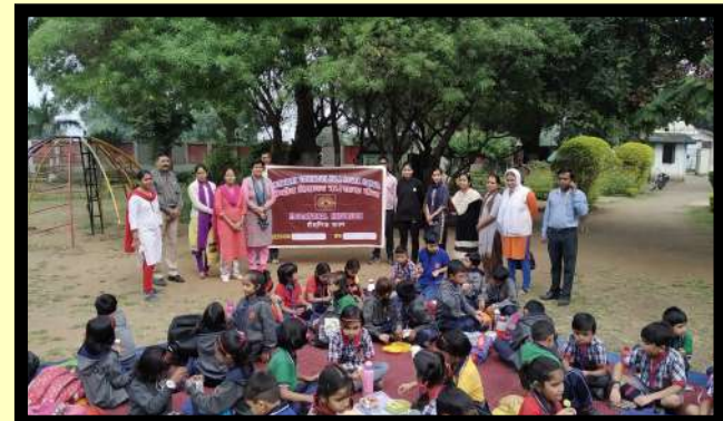
VISIT TO SANJIVANI PARK