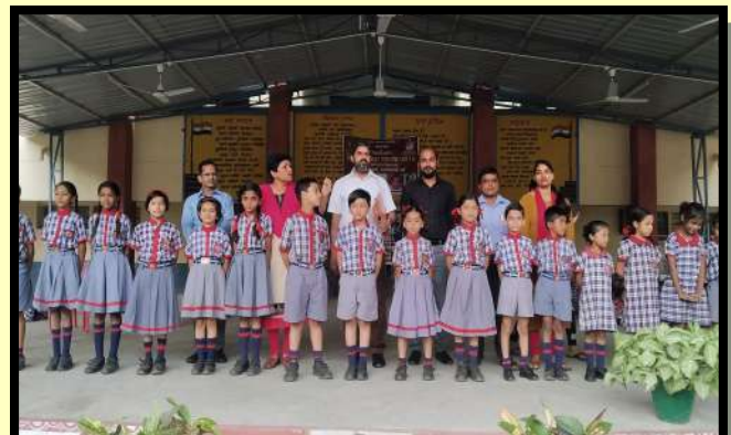
WINNERS OF PLEDGE COMPETITION