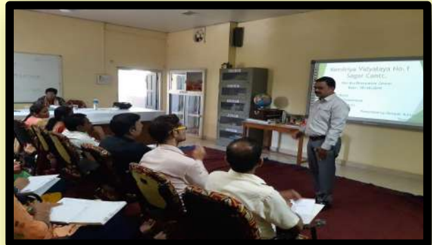
V P TAKING SESSION ON CODE OF CONDUCT