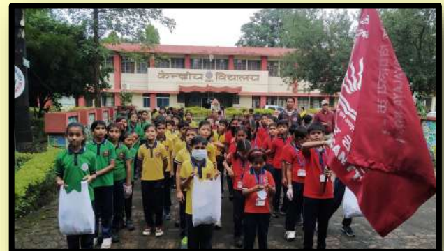
STUDENTS ALL SET FOR SWACHTA ABHIYAN