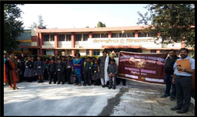
STUDENTS VISIT TO MUSEUM

Excursions are a great way for primary students to develop their social skills, enhance their learning and have fun with their friends way from the familiar school grounds.