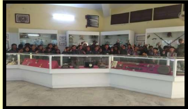
Class IV STUDENTS VISIT TO MRC MUSEUM