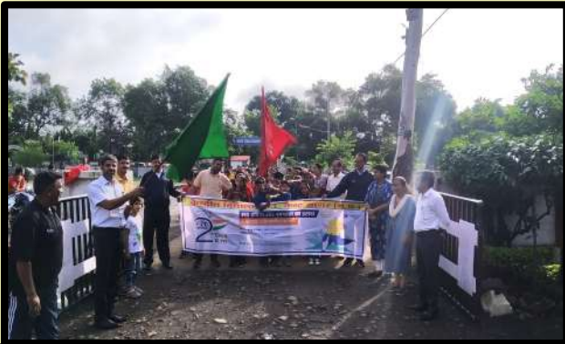
FLAG OFF BY THE PRINCIPAL FOR UNITY RUN

Gandhi Jayanti was celebrated by organizing Run for Unity, Swacchta Abhiyan & singing of bhajan "Vaishnav Jan to". Students of Primary Section participated with great